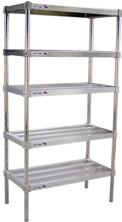
Adjust-A-Shelf – H.D. Series